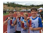
10 year old Boys Relay

ensuring that we could take as many students as possible. A great day was had by all participants.