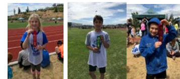
Individual races and Relays