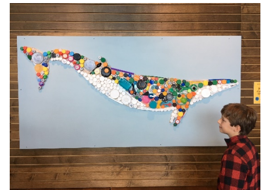
Admiring the Recycled Whale art. Created from plastic found on the beaches