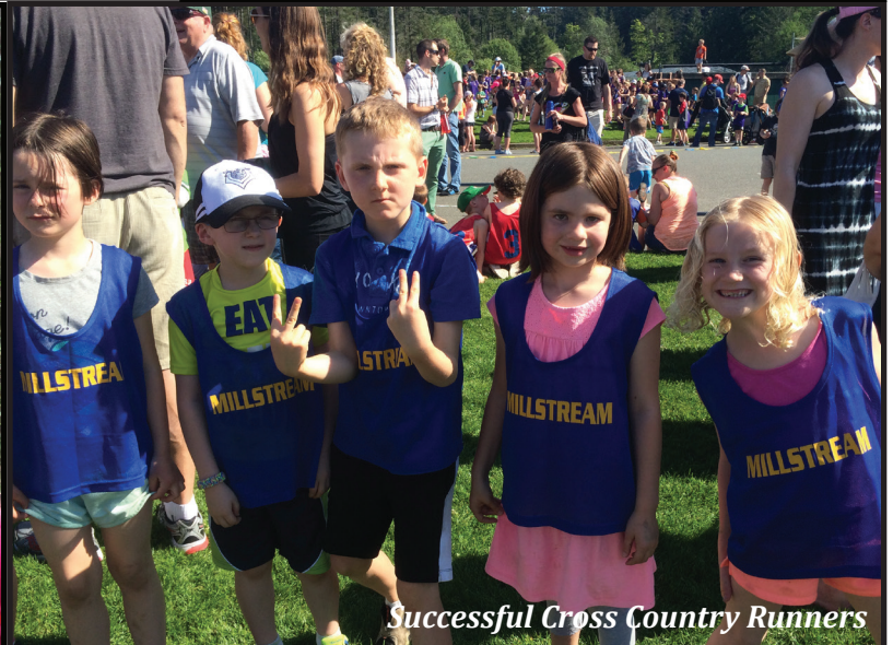
Successful Cross Country Runners